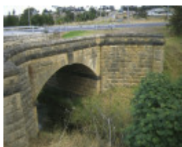
1 bridge over waurn ponds creek side view apr1997