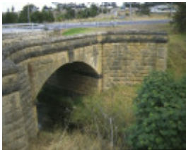
1 bridge over waurn ponds creek side view apr1997