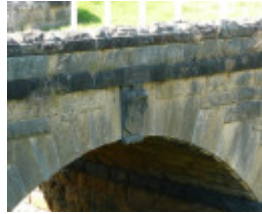
BRIDGE SOHE 2008