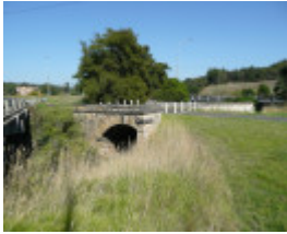
BRIDGE SOHE 2008