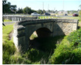
BRIDGE SOHE 2008