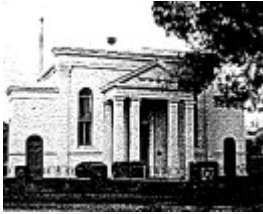
Synagogue Barkly St Princes St - Ballarat Heritage Review, 1998