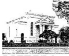
Synagogue - Film 2 / Frame 31- Ballarat Conservation Study, 1978