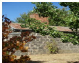
Beaufort House stable block