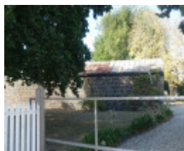
Beaufort House stable block