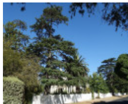
Beaufort House garden showing mature trees including Deodar cedars, Canary Island palm, Cypress and Oak