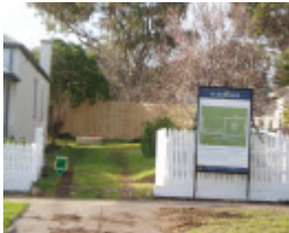
Stavely, 1 Henry Street, Queenscliff