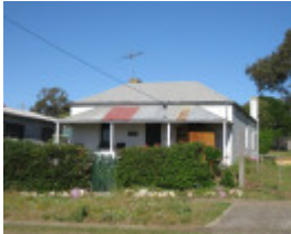
Stavely, 1 Henry Street, Queenscliff