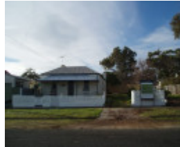
Stavely, 1 Henry Street, Queenscliff