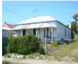
Stavely, 1 Henry Street, Queenscliff