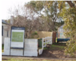
Stavely, 1 Henry Street, Queenscliff