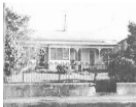
58 Hesse Street, Queenscliff