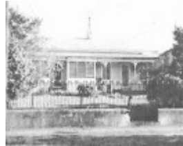
58 Hesse Street, Queenscliff