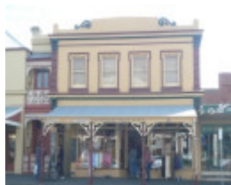
58 Hesse Street, Queenscliff