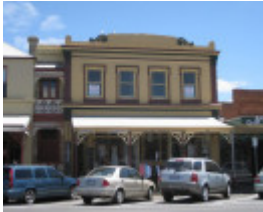
58 Hesse Street, Queenscliff