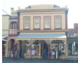
58 Hesse Street, Queenscliff