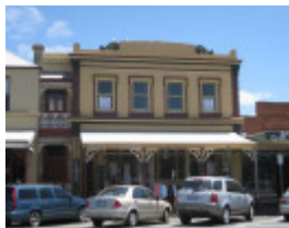
58 Hesse Street, Queenscliff