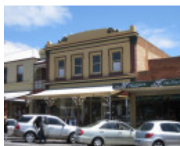
58 Hesse Street, Queenscliff