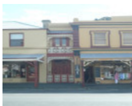
58 Hesse Street, Queenscliff