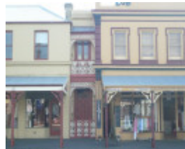
58 Hesse Street, Queenscliff