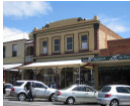
58 Hesse Street, Queenscliff