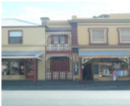
58 Hesse Street, Queenscliff