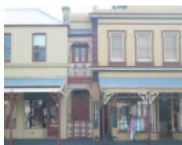
58 Hesse Street, Queenscliff