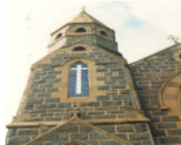
1 crossroads uniting church werribee tower detail