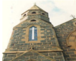
1 crossroads uniting church werribee tower detail