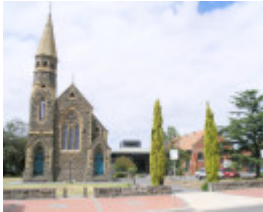
CROSSROADS UNITING CHURCH SOHE 2008