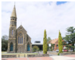
CROSSROADS UNITING CHURCH SOHE 2008