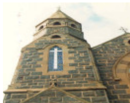
1 crossroads uniting church werribee tower detail