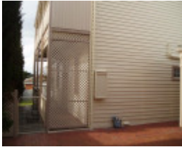
Oceania, 61 Hesse Street, Queenscliff