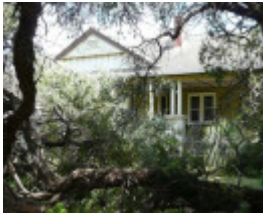
Oceania, 61 Hesse Street, Queenscliff