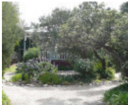
Oceania, 61 Hesse Street, Queenscliff