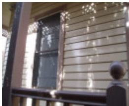
Oceania, 61 Hesse Street, Queenscliff