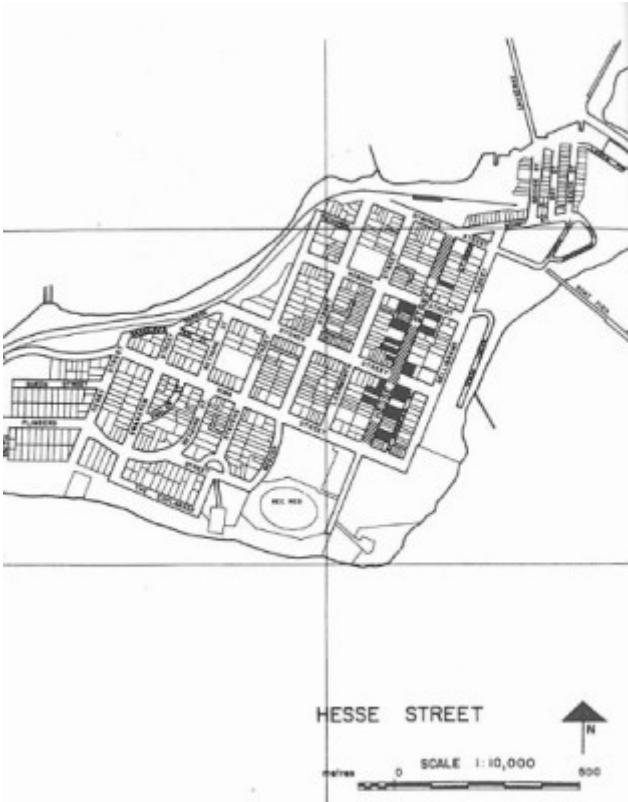
Oceania House location