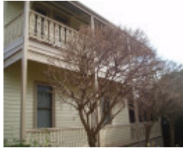
Oceania, 61 Hesse Street, Queenscliff