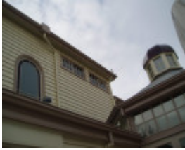
Oceania, 61 Hesse Street, Queenscliff