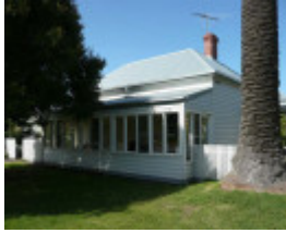
Oceania, 61 Hesse Street, Queenscliff