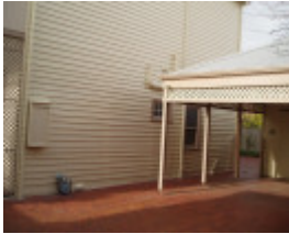
Oceania, 61 Hesse Street, Queenscliff