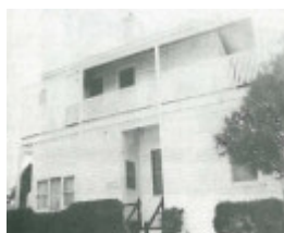
Oceania House 1981. (East facade)