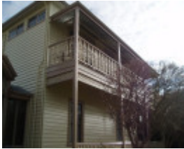
Oceania, 61 Hesse Street, Queenscliff