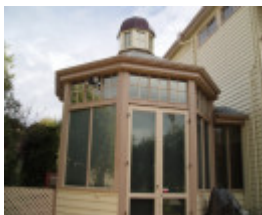
Oceania, 61 Hesse Street, Queenscliff