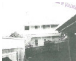
Oceania House, c.1888. (North facade)