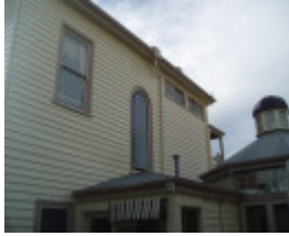
Oceania, 61 Hesse Street, Queenscliff