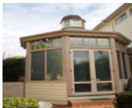
Oceania, 61 Hesse Street, Queenscliff