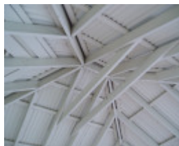
Oceania, 61 Hesse Street, Queenscliff