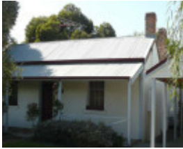
Oceania, 61 Hesse Street, Queenscliff