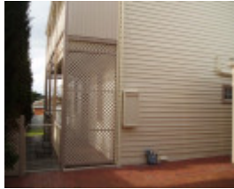
Oceania, 61 Hesse Street, Queenscliff