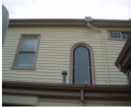
Oceania, 61 Hesse Street, Queenscliff