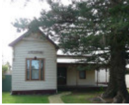
Oceania, 61 Hesse Street, Queenscliff