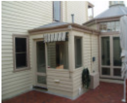
Oceania, 61 Hesse Street, Queenscliff