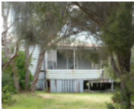
Oceania, 61 Hesse Street, Queenscliff