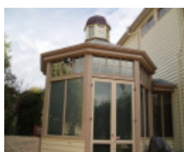
Oceania, 61 Hesse Street, Queenscliff