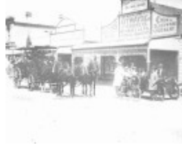
72 and 74 Hesse Street c.1905.