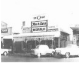
72 Hesse Street, Queenscliff