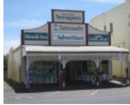
72 Hesse Street, Queenscliff