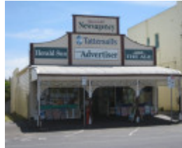
72 Hesse Street, Queenscliff