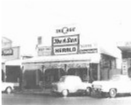
72 Hesse Street, Queenscliff