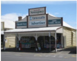
72 Hesse Street, Queenscliff