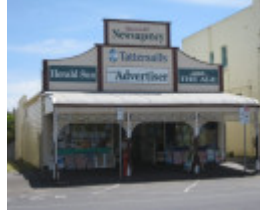
72 Hesse Street, Queenscliff