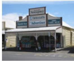
Former Bank of Victoria, 76 Hesse Street, Queenscliff