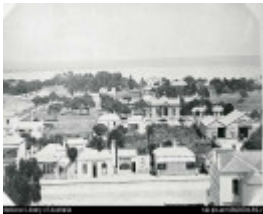
NLA c1880 _ former Bank of Victoria, 76 Hesse Street, Queenscliff