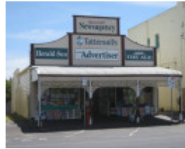
Former Bank of Victoria, 76 Hesse Street, Queenscliff