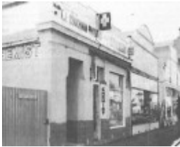
Former Bank of Victoria, 76 Hesse Street, Queenscliff