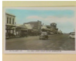
SLV 1945 _ Former Bank of Victoria, 76 Hesse Street, Queenscliff