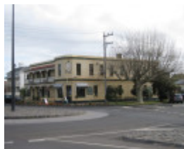
Seaview Guest house, 86 Hesse Street, Queenscliff