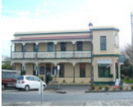
Seaview Guest house, 86 Hesse Street, Queenscliff