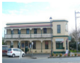
Seaview Guest house, 86 Hesse Street, Queenscliff