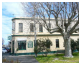
Seaview Guest house, 86 Hesse Street, Queenscliff