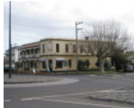
Seaview Guest house, 86 Hesse Street, Queenscliff