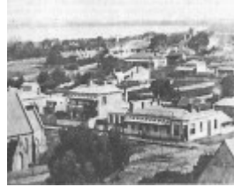
Seaview Guest House, c.1880.