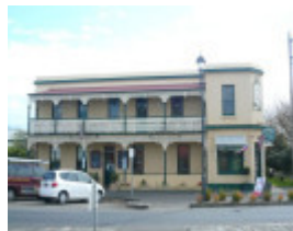
Seaview Guest house, 86 Hesse Street, Queenscliff