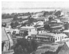
Seaview Guest House, c.1880.