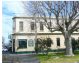
Seaview Guest house, 86 Hesse Street, Queenscliff