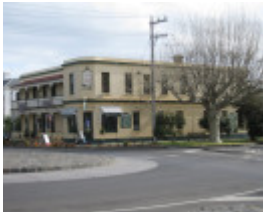
Seaview Guest house, 86 Hesse Street, Queenscliff