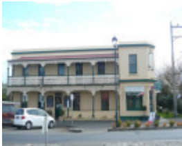
Seaview Guest house, 86 Hesse Street, Queenscliff