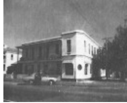
SeaView Guest House, 1981