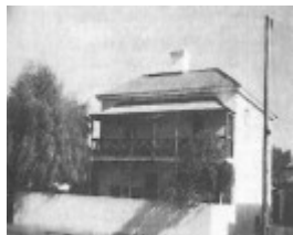
Coombe Lodge, 90 Hesse Street, Queenscliff,