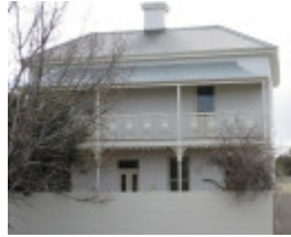
Coombe Lodge, 90 Hesse Street, Queenscliff,