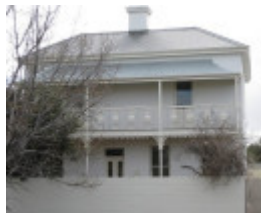
Coombe Lodge, 90 Hesse Street, Queenscliff,