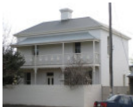
Coombe Lodge, 90 Hesse Street, Queenscliff,