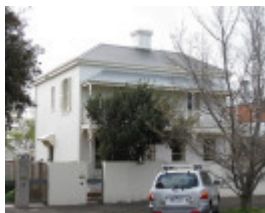
Coombe Lodge, 90 Hesse Street, Queenscliff,