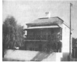
Coombe Lodge, 90 Hesse Street, Queenscliff,