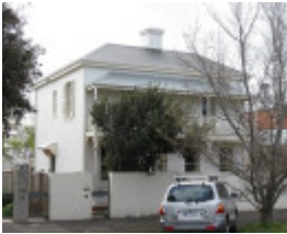
Coombe Lodge, 90 Hesse Street, Queenscliff,