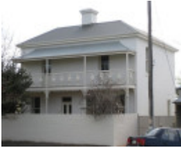
Coombe Lodge, 90 Hesse Street, Queenscliff,