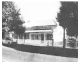
Warley and Shenfield Cottages.