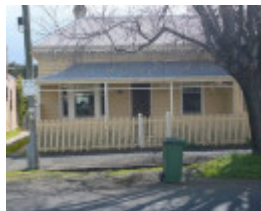
Warley Cottage, 94 Hesse Street and Shenfield, 96 Hesse Street, Queenscliff