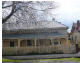
Warley Cottage, 94 Hesse Street and Shenfield, 96 Hesse Street, Queenscliff