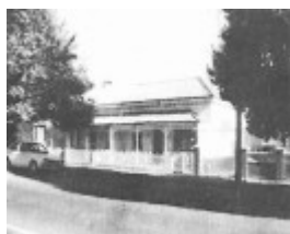
Warley and Shenfield Cottages.