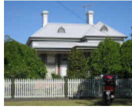
Carnbrea, 95 Hesse Street, Queenscliff