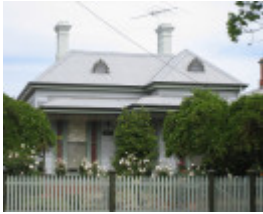
Carnbrea, 95 Hesse Street, Queenscliff