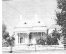
Carnbrea, 95 Hesse Street, Queenscliff