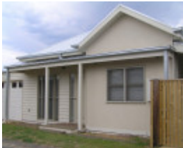
rear of 95 Hesse Street, Queenscliff