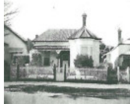
Romford, 105 Hesse Street, Queenscliff