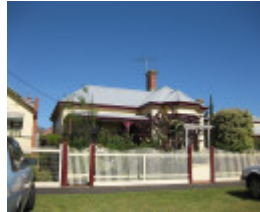
Romford, 105 Hesse Street, Queenscliff