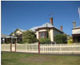
Romford, 105 Hesse Street, Queenscliff