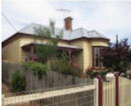
Romford, 105 Hesse Street, Queenscliff