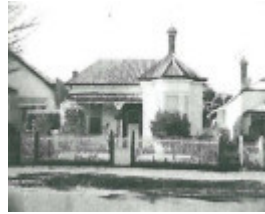
Romford, 105 Hesse Street, Queenscliff