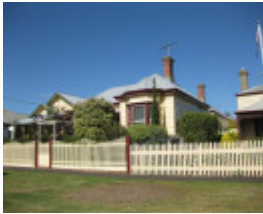
Romford, 105 Hesse Street, Queenscliff