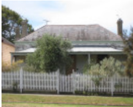
Sefton, 22 King Street, Queenscliff