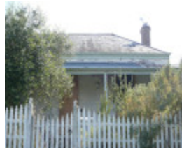
Sefton, 22 King Street, Queenscliff