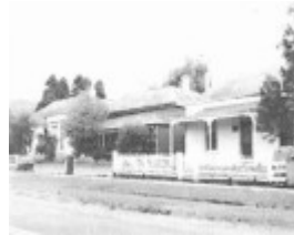
Sefton, 22 King Street, Queenscliff