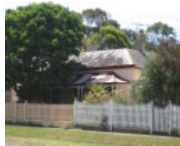
Alikum, 24 King Street, Queenscliff