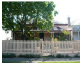
Alikum, 24 King Street, Queenscliff