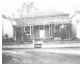
Alikum, 24 King Street, Queenscliff