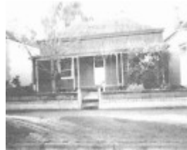
Alikum, 24 King Street, Queenscliff