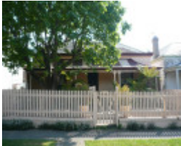
Alikum, 24 King Street, Queenscliff