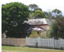
Alikum, 24 King Street, Queenscliff