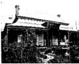
Yarrowee Hall 1 Darling St - Ballarat Heritage Review, 1998