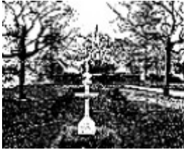
Eureka Stockade Memorial - Ballarat Heritage Review, 1998