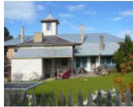
Bronte, 11-13 Learmonth Street, Queenscliff