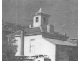
Bronte, 11-13 Learmonth Street, Queenscliff