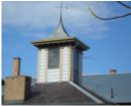
Bronte, 11-13 Learmonth Street, Queenscliff