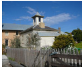
Bronte, 11-13 Learmonth Street, Queenscliff