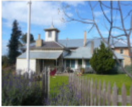
Bronte, 11-13 Learmonth Street, Queenscliff