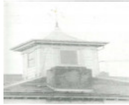
Bronte, 11-13 Learmonth Street, Queenscliff