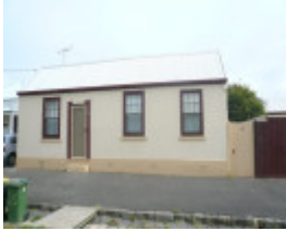
Nippy-Ville, 26 Learmonth Street, Queenscliff