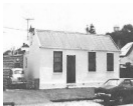
Nippy-Ville, 26 Learmonth Street, Queenscliff