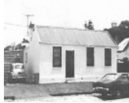
Nippy-Ville, 26 Learmonth Street, Queenscliff