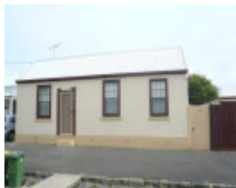
Nippy-Ville, 26 Learmonth Street, Queenscliff