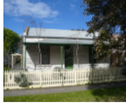
31 Learmonth Street, Queenscliff