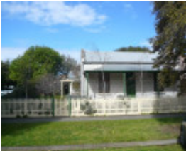
31 Learmonth Street, Queenscliff