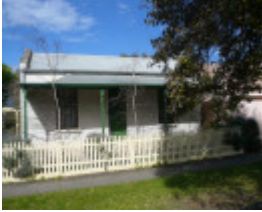
31 Learmonth Street, Queenscliff