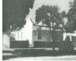
31 Learmonth Street, Queenscliff