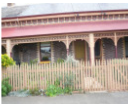
Thanet Terrace, (formerly Thanet Cottages), 34-44 Learmonth Street Queenscliff