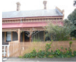
Thanet Terrace, (formerly Thanet Cottages), 34-44 Learmonth Street Queenscliff