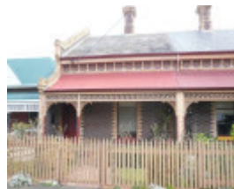
Thanet Terrace, (formerly Thanet Cottages), 34-44 Learmonth Street Queenscliff