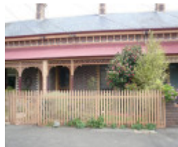
Thanet Terrace, (formerly Thanet Cottages), 34-44 Learmonth Street Queenscliff