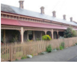
Thanet Terrace, (formerly Thanet Cottages), 34-44 Learmonth Street Queenscliff