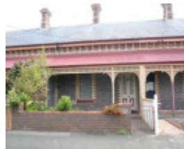
Thanet Terrace, (formerly Thanet Cottages), 34-44 Learmonth Street Queenscliff