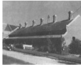
Thanet Terrace, (formerly Thanet Cottages), 36-46 Learmonth Street, Queenscliff