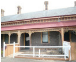
Thanet Terrace, (formerly Thanet Cottages), 34-44 Learmonth Street Queenscliff