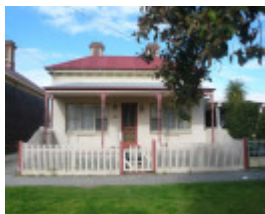
Lindores, 43 Learmonth Street (unnamed), Queenscliff