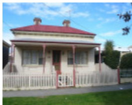
Lindores, 43 Learmonth Street (unnamed), Queenscliff