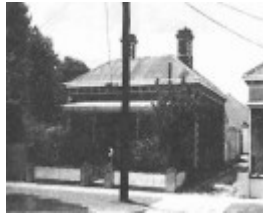
41-43 Learmonth Street, Queenscliff