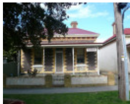
Lindores, (No. 41 Learmonth Street)