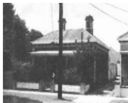
41-43 Learmonth Street, Queenscliff