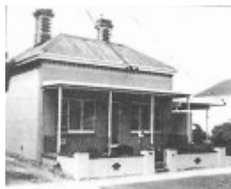
41-43 Learmonth Street, Queenscliff