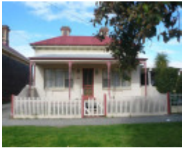
Lindores, 43 Learmonth Street (unnamed), Queenscliff