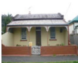
64 Learmonth Street, Queenscliff