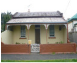
64 Learmonth Street, Queenscliff