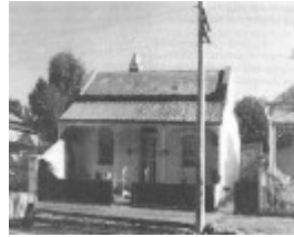
64 Learmonth Street, Queenscliff