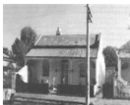
64 Learmonth Street, Queenscliff