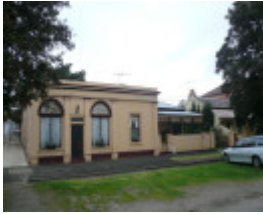
66 Learmonth Street, Queenscliff