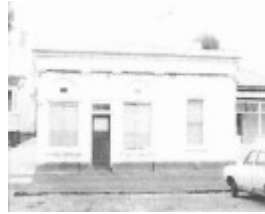
66 Learmonth Street, Queenscliff