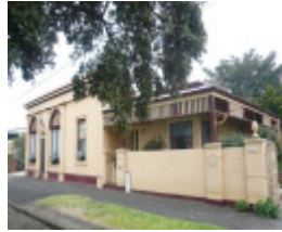
66 Learmonth Street, Queenscliff