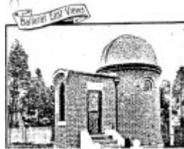
Ballarat Observatory03 - Illustration from Ballarat Illustrated c1919, facsimile edition 1972 - Ballarat Conservation Study, 1978