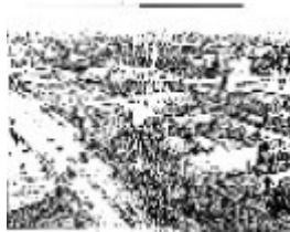
Former Town Hall Hotel Armstrong St02 - View of Town Hall Hotel from Town Hall tower - Ballarat Conservation Study, 1978