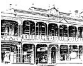
Old Colonists Hall 16-24 Lydiard St - Film 1 /Frame 21 - Ballarat Conservation Study, 1978