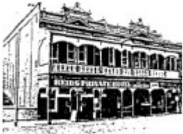
Reids Coffee Palace - Film 6 / Frame 35 - Ballarat Conservation Study, 1978