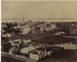
View south east from St Georges Tower, Queenscliff c. 1880-1900.