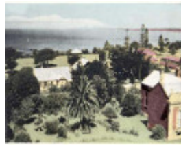
Queenscliff General View c. 1950 looking across the former Custom Reserve.