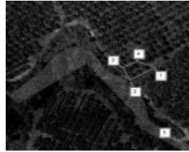
HO197 5 Pear Trees