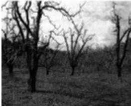
HO197 5 Pear Trees