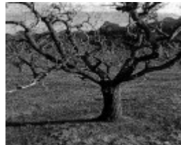
HO197 5 Pear Trees