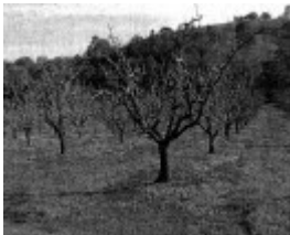
HO197 5 Pear Trees