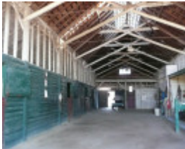
ST ALBANS HOMESTEAD SOHE 2008