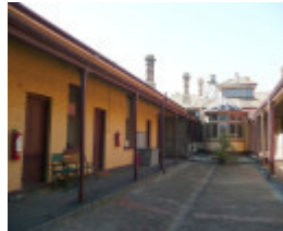
ST ALBANS HOMESTEAD SOHE 2008