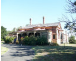
ST ALBANS HOMESTEAD SOHE 2008