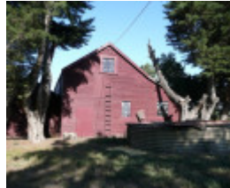
ST ALBANS HOMESTEAD SOHE 2008