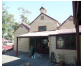
ST ALBANS HOMESTEAD SOHE 2008