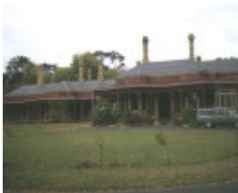
1 st albans homestead whittington front view apr1997