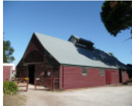
ST ALBANS HOMESTEAD SOHE 2008