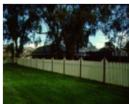
Keilor Hotel Side