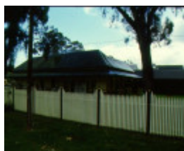
Keilor Hotel Side