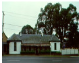
H01974 1 keilor hotel front