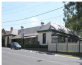
KEILOR HOTEL SOHE 2008