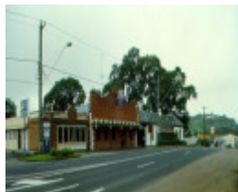
Keilor Hotel Facade