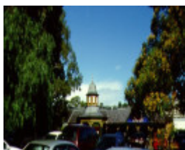
Keilor Hotel Rear