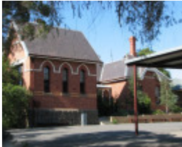
WHITTLESEA PRIMARY SCHOOL NO. 2090 SOHE 2008