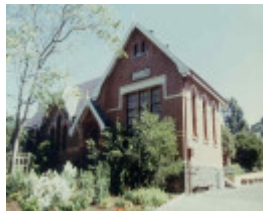
1 primary school no 2090 plenty road whittlesea front view