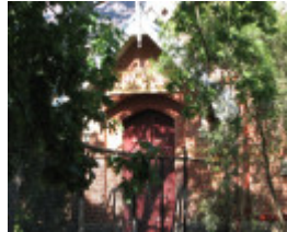
WHITTLESEA PRIMARY SCHOOL NO. 2090 SOHE 2008