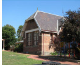
WHITTLESEA PRIMARY SCHOOL NO. 2090 SOHE 2008