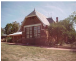
h01717 whittlesea primary school no 2090 plenty road whittlesea exterior she project 2004