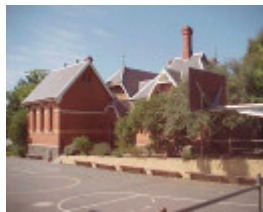
h01717 whittlesea primary school no 2090 plenty road whittlesea playground she project 2004