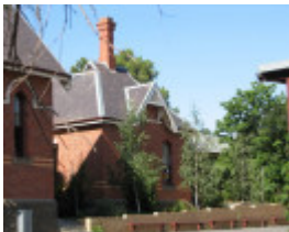
WHITTLESEA PRIMARY SCHOOL NO. 2090 SOHE 2008