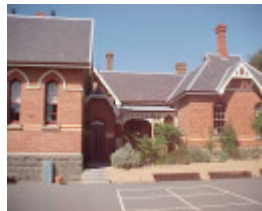
h01717 whittlesea primary school no 2090 plenty road whittlesea close up she project 2004