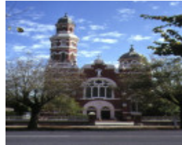
1 st josephs benalla front view