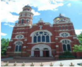
ST JOSEPHS CATHOLIC CHURCH SOHE 2008