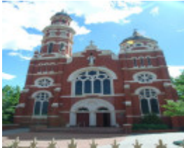
ST JOSEPHS CATHOLIC CHURCH SOHE 2008