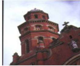
st josephs benalla detail of tower jun1989