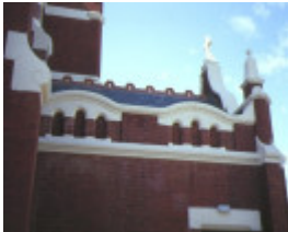
st josephs benalla exterior detail of wavy parapet