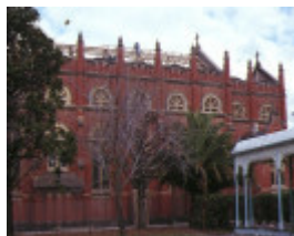
st josephs benalla north side jan1989