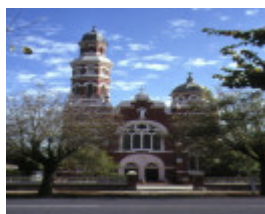
1 st josephs benalla front view