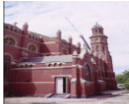
st josephs benalla rear entry dec1989