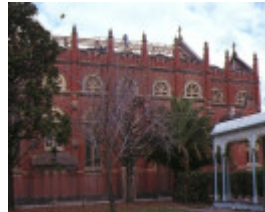
st josephs benalla north side jan1989