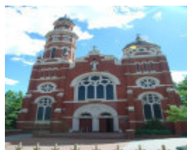
ST JOSEPHS CATHOLIC CHURCH SOHE 2008