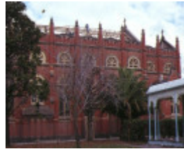
st josephs benalla north side jan1989