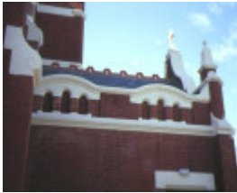
st josephs benalla exterior detail of wavy parapet