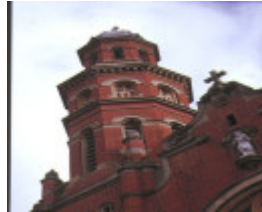
st josephs benalla detail of tower jun1989