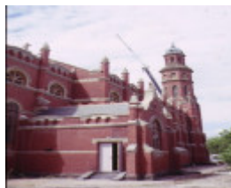
st josephs benalla rear entry dec1989