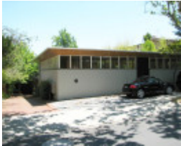
GROUNDS HOUSE SOHE 2008