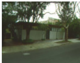
H01963 roy grounds house hill street facade aug01