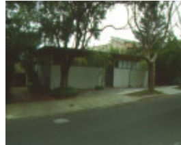
H01963 roy grounds house hill street facade aug01