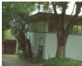
H01963 roy grounds house driveway aug01