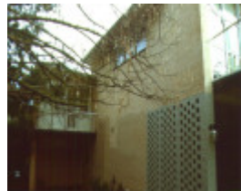
H01963 roy grounds house flats aug01