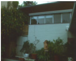
H01963 roy grounds house rear view aug01