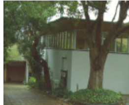
H01963 roy grounds house driveway aug01