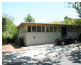
GROUNDS HOUSE SOHE 2008