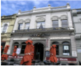
FORMER ADVERTISER BUILDING SOHE 2008