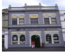
1 former advertiser building nelson place williamstown front elevation