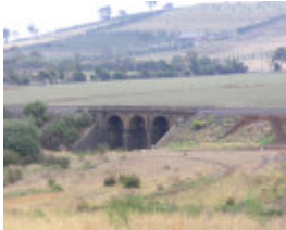
RAILWAY BRIDGE, SUNBURY HILL SOHE 2008