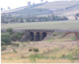
RAILWAY BRIDGE, SUNBURY HILL SOHE 2008