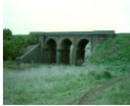
H01964 sunbury rail bridge