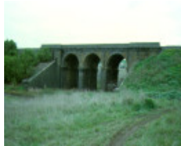
H01964 sunbury rail bridge