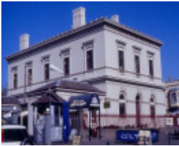
former customs house cnr nelson place and syme st williamstown cnr view she project 2003