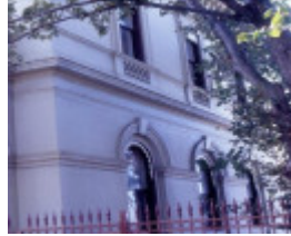
former customs house cnr nelson place and syme st williamstown close up windows she project 2003