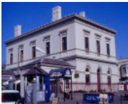
former customs house cnr nelson place and syme st williamstown cnr view she project 2003