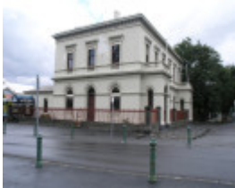
FORMER CUSTOMS HOUSE SOHE 2008