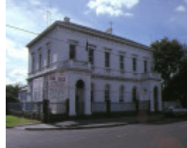
1 former customs house nelson place williamstown front view