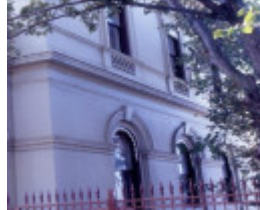
former customs house cnr nelson place and syme st williamstown close up windows she project 2003