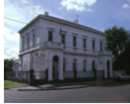
1 former customs house nelson place williamstown front view