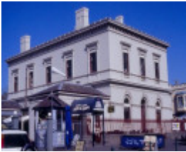
former customs house cnr nelson place and syme st williamstown cnr view she project 2003