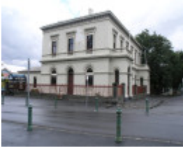
FORMER CUSTOMS HOUSE SOHE 2008