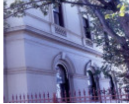
former customs house cnr nelson place and syme st williamstown close up windows she project 2003