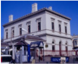
former customs house cnr nelson place and syme st williamstown cnr view she project 2003