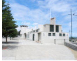
DRESSING PAVILION SOHE 2008