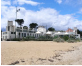
DRESSING PAVILION SOHE 2008