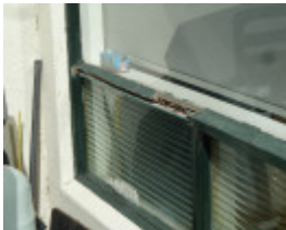
H0927 DRESSING PAVILION LHA 2015 4.JPG