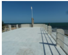
H0927 DRESSING PAVILION LHA 2015 3.JPG