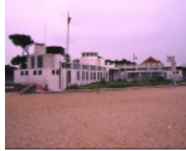
1 dressing pavillion the esplanade williamstown rear view from beach