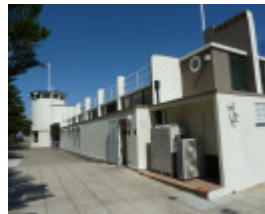
H0927 DRESSING PAVILION LHA 2015 2.JPG