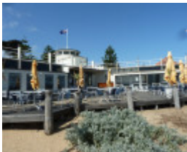
H0927 DRESSING PAVILION LHA 2015 1.JPG