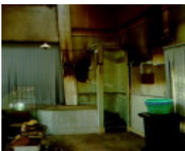
H01973 mirboo on tarwin hall stage approach 2001