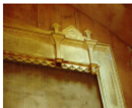
H01973 mirboo on tarwin hall proscenium detail 2001