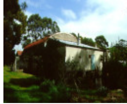
H01973 mirboo on tarwin hall rear 2001