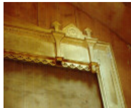
H01973 mirboo on tarwin hall proscenium detail 2001