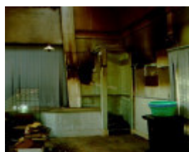
H01973 mirboo on tarwin hall stage approach 2001