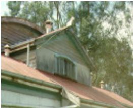
H01973 mirboo on tarwin hall bio box exterior 2001