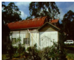
H01973 mirboo on tarwin hall west side 2001