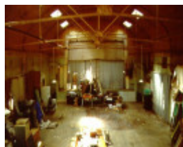
H01973 mirboo on tarwin hall interior 2001