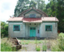
H01973 MIRBOO ON TARWIN HALL SOHE 2008