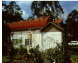
H01973 mirboo on tarwin hall west side 2001