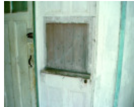
H01973 mirboo on tarwin hall ticket door 2001