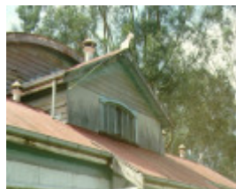
H01973 mirboo on tarwin hall bio box exterior 2001