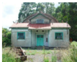
H01973 MIRBOO ON TARWIN HALL SOHE 2008