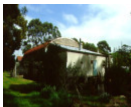
H01973 mirboo on tarwin hall rear 2001