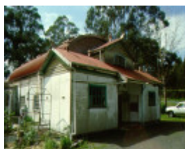
H01973 1 mirboo on tarwin hall 2001