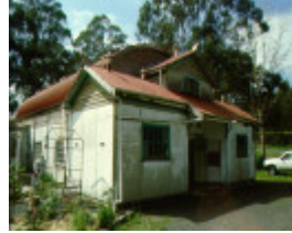
H01973 1 mirboo on tarwin hall 2001