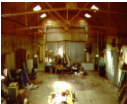
H01973 mirboo on tarwin hall interior 2001