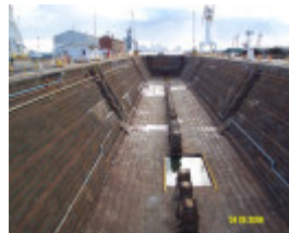
h00697 1 alfred graving dock williamstown dockyard williamstown wide view she project 2004