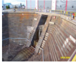
h00697 alfred graving dock williamstown dockyard williamstown steps she project 2004