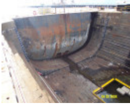
h00697 alfred graving dock williamstown dockyard williamstown close up she project