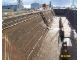
h00697 alfred graving dock williamstown dockyard williamstown side view she project 2004