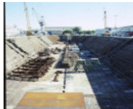
h00697 alfred graving dock williamstown dockyard williamstown front view