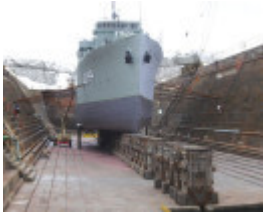
ALFRED GRAVING DOCK SOHE 2008