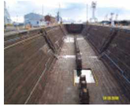
h00697 1 alfred graving dock williamstown dockyard williamstown wide view she project 2004