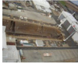
ALFRED GRAVING DOCK SOHE 2008