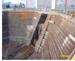
h00697 alfred graving dock williamstown dockyard williamstown steps she project 2004