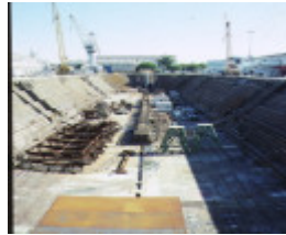
h00697 alfred graving dock williamstown dockyard williamstown front view