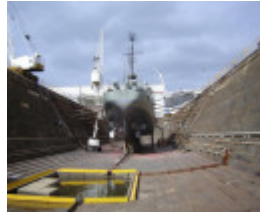
ALFRED GRAVING DOCK SOHE 2008