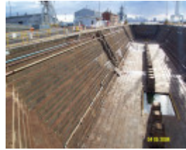
h00697 alfred graving dock williamstown dockyard williamstown side view she project 2004