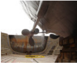
ALFRED GRAVING DOCK SOHE 2008