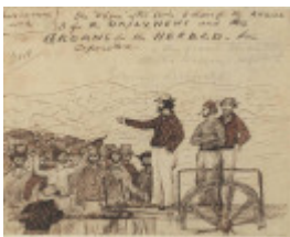
1854 Pen and ink sketch of speakers at the Monster Meeting (artist unknown)