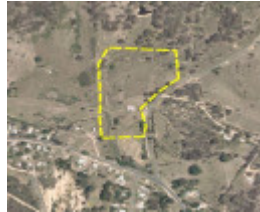
monster meeting site air photo.JPG