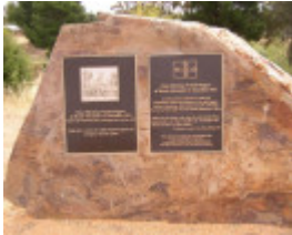
Monument at the Monster Meeting Site, erected by the Ballarat Reform League Inc. on registered land