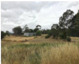
Monster Meeting site