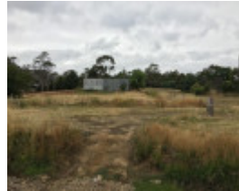
Photo taken from a location similar to that in the 1851 engraving