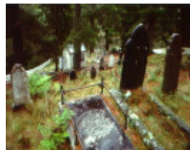
H01976 walhalla cemterey