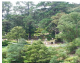
WALHALLA CEMETERY SOHE 2008