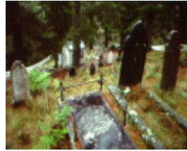
H01976 walhalla cemterey