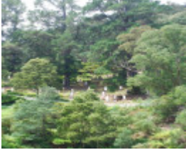
WALHALLA CEMETERY SOHE 2008