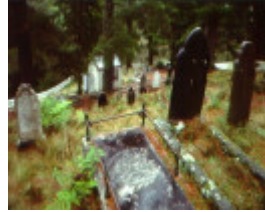
H01976 walhalla cemterey