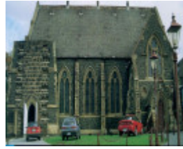
St Giles Church Gheringhap Street Geelong Front Elevation