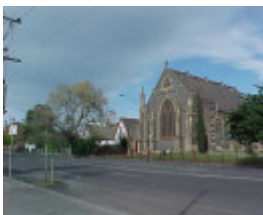
H00633 1 former st giles church and free church school geelong oct01