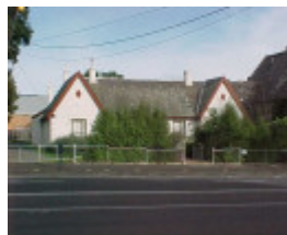
H00633 st giles geelong free church school oct01