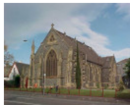
H00633 st giles church geelong church front view oct01