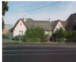
H00633 st giles geelong free church school oct01