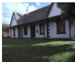
St Giles Church Gheringhap Street Geelong Former Free Church School May 1985