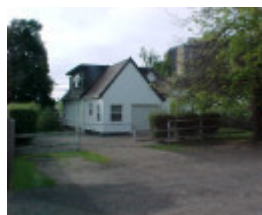
H00633 st giles church gheringhap street geelong rear of masters residence oct01