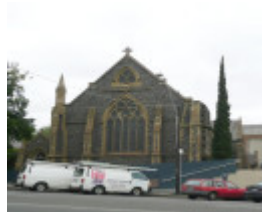
FORMER ST GILES CHURCH AND FREE CHURCH SCHOOL SOHE 2008