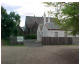
H00633 st giles church gheringhap street geelong rear of school oct01