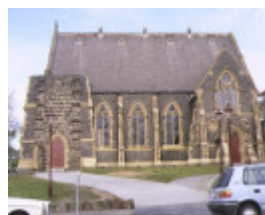
St Giles Church Geelong Church Front View