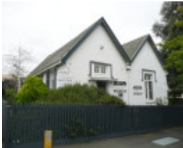
FORMER ST GILES CHURCH AND FREE CHURCH SCHOOL SOHE 2008