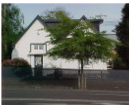
H00633 st giles geelong masters residence oct01