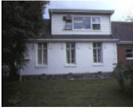
St Giles Church Gheringhap Street Geelong Former School Masters Residence Jul 1985