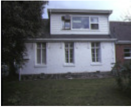
St Giles Church Gheringhap Street Geelong Former School Masters Residence Jul 1985