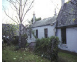
St Giles Church Gheringhap Street Geelong Manse Former Free Church School Side View Jul 1985