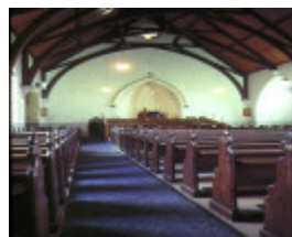
H00633 st giles church gheringhap street geelong interior view of church