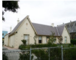
FORMER ST GILES CHURCH AND FREE CHURCH SCHOOL SOHE 2008