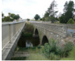
BRIDGE SOHE 2008