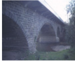
1 bridge over barwon river winchelsea arch detail jun1984