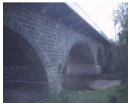
1 bridge over barwon river winchelsea arch detail jun1984