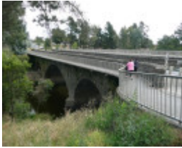
BRIDGE SOHE 2008