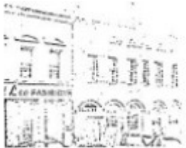
The Ballarat Courier - Film 2 / Frame 5 - Ballarat Conservation Study, 1978