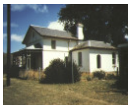
1 woodend court house forest street woodend side view