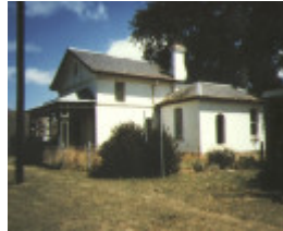
1 woodend court house forest street woodend side view