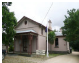
WOODEND COURT HOUSE SOHE 2008