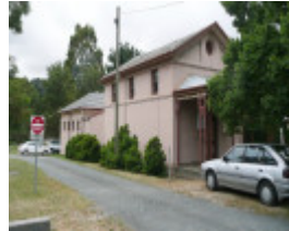
WOODEND COURT HOUSE SOHE 2008