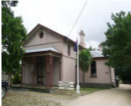
WOODEND COURT HOUSE SOHE 2008