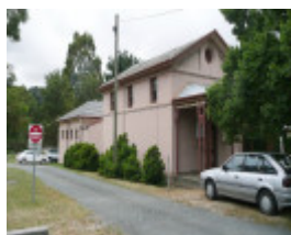
WOODEND COURT HOUSE SOHE 2008