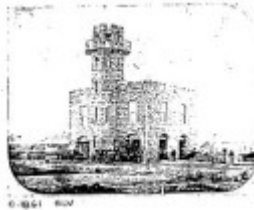
ballarat City Fire Station - c.1861