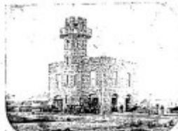
ballarat City Fire Station - c.1861 SLV - Ballarat Conservation Study, 1978