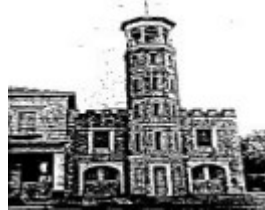
ballarat City Fire Station - Film 3 / Frame 22 - Ballarat Conservation Study, 1978