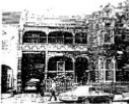
708 Sturt Street - - Film 3 / Frame 28 - Ballarat Conservation Study, 1978